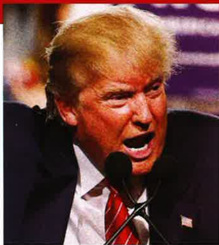
Republican for PRESIDENT Donald TRUMP